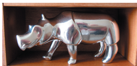
The latest, a robot-like acquisition.