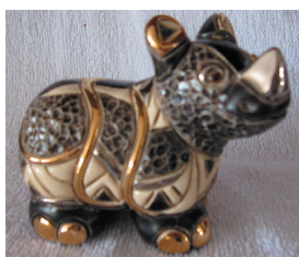
Child of the cream and black pair shown in Q409.